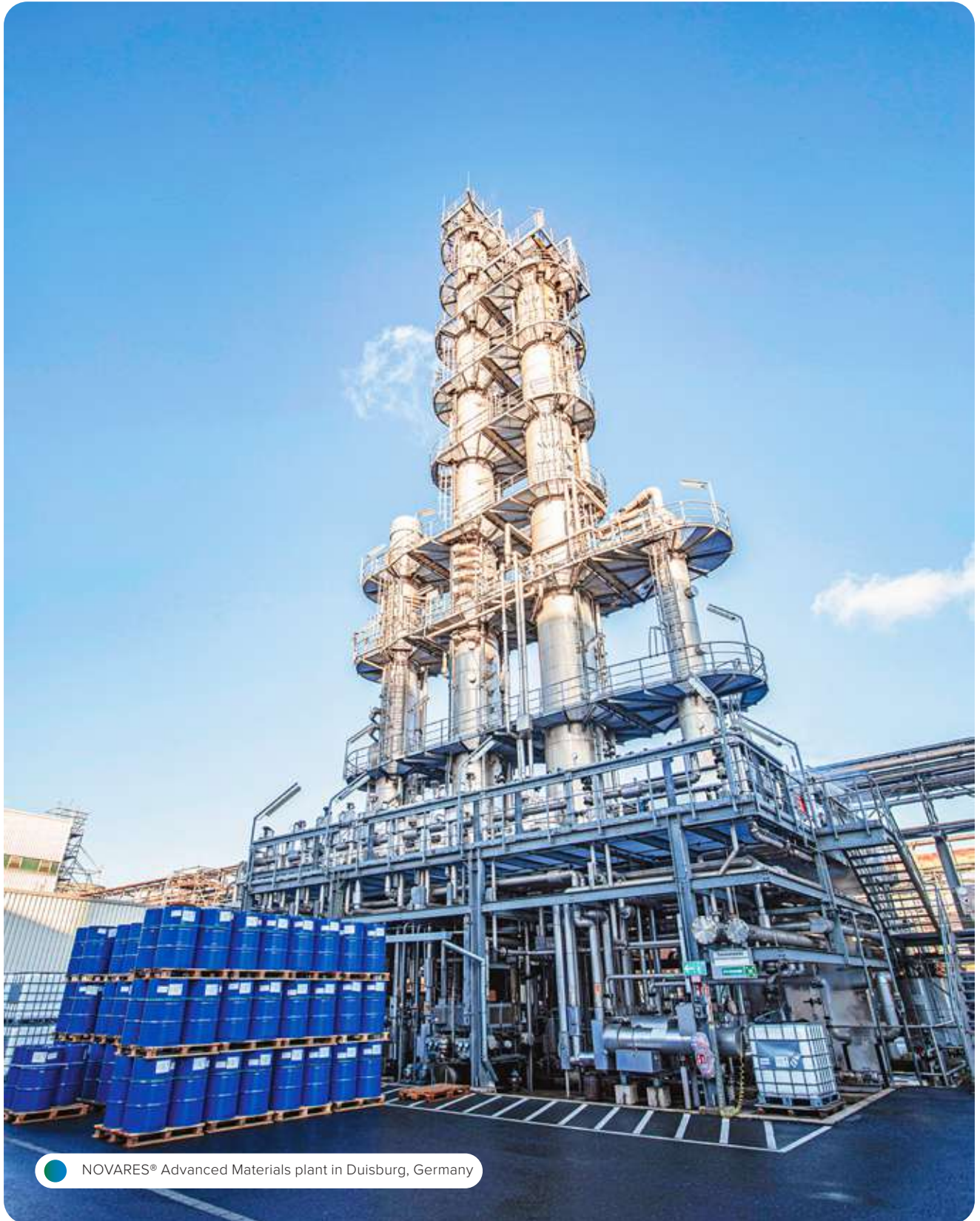
NOVARES® Advanced Materials plant in Duisburg, Germany